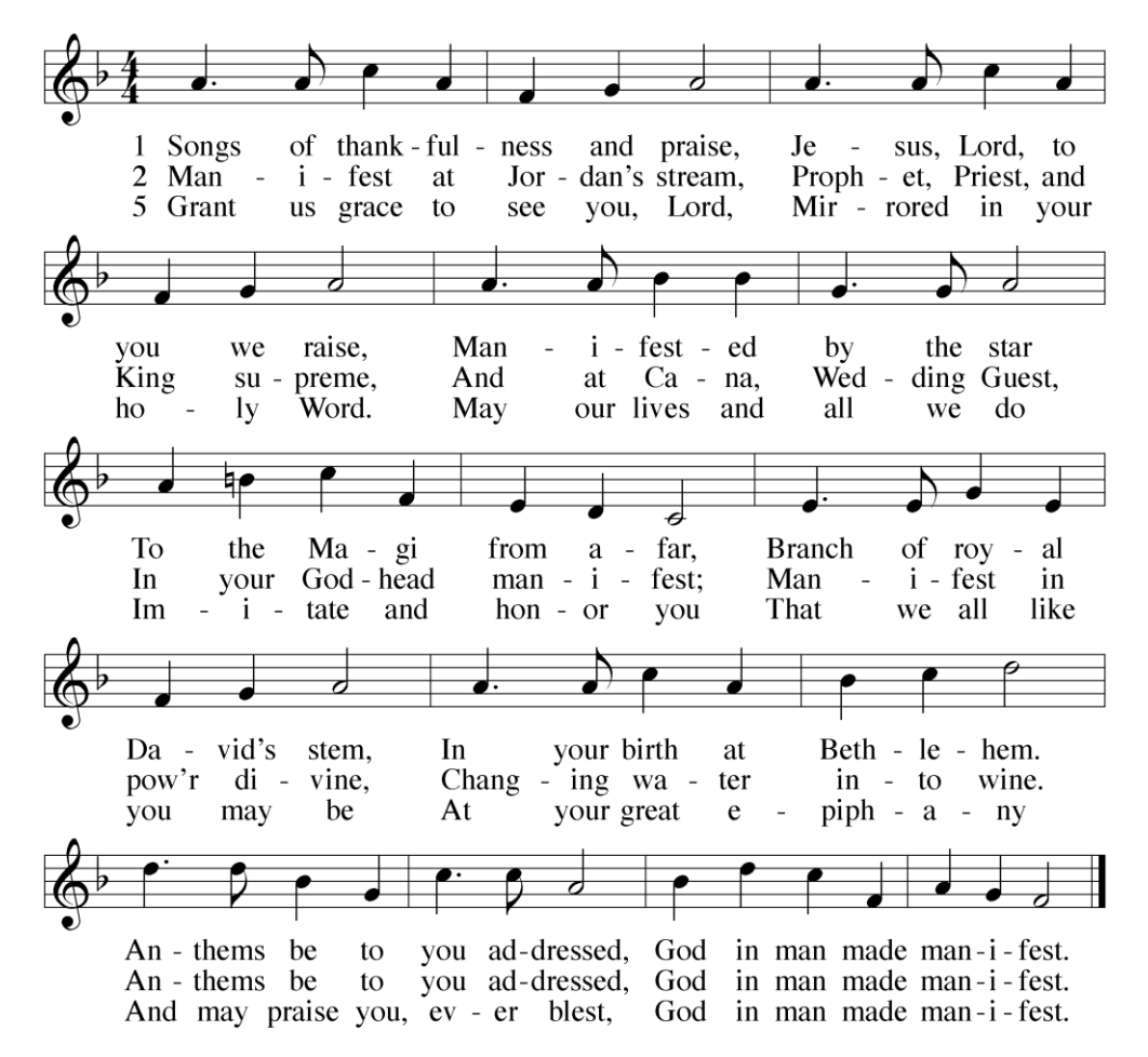
Hymn of the Day: #82, verses 1,2,5 "Songs of Thankfulness and Praise"

Text: Christopher Wordsworth, 1807-85, alt.