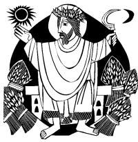
Christ the King